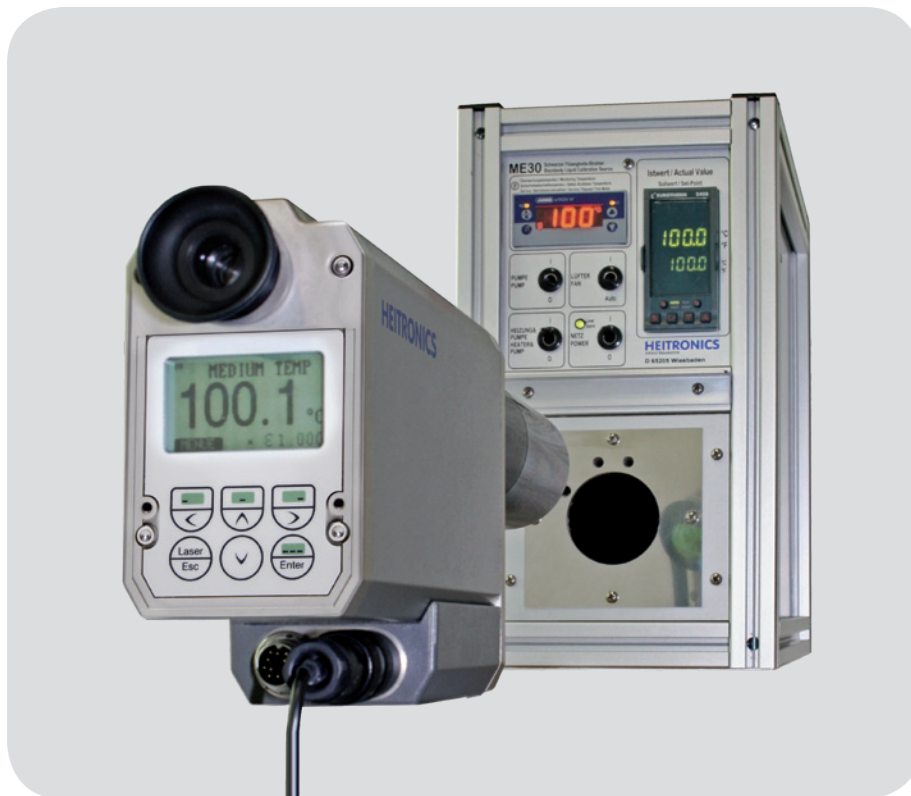
Figure 2: Calibration of ME30 with Transfer Radiation Thermometer (TRT)

Detailed information of the calibration schemes you will find in the instruction manual ME30.